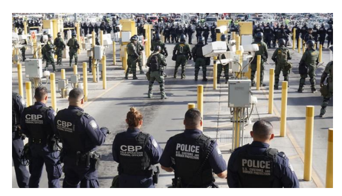
CBP agents performing drills closing the San Ysidro port of entry.

avoiding unnecessary contact with others.